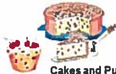
Cakes and Puddings