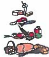
And many more