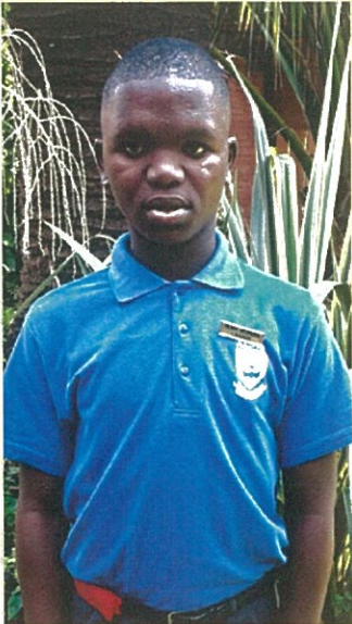
Obakeng Senabe Group 18