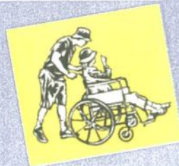
Dudu Lushaba Group 15