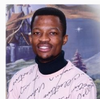
General Assistant Junior